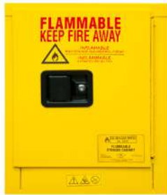
Flammable Safety Cabinet (Holds 4 Gallons)