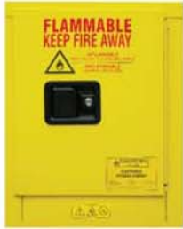
Flammable Safety Cabinet (Holds 4 Gallons)